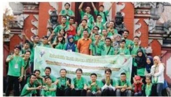
Tolerance in practice: Participants of the Interfaith Youth Forum pose in front of a Hindu temple in Palangka Raya, Central Kalimantan. The temple is part of an event taking place from Nov. 19 to 22.